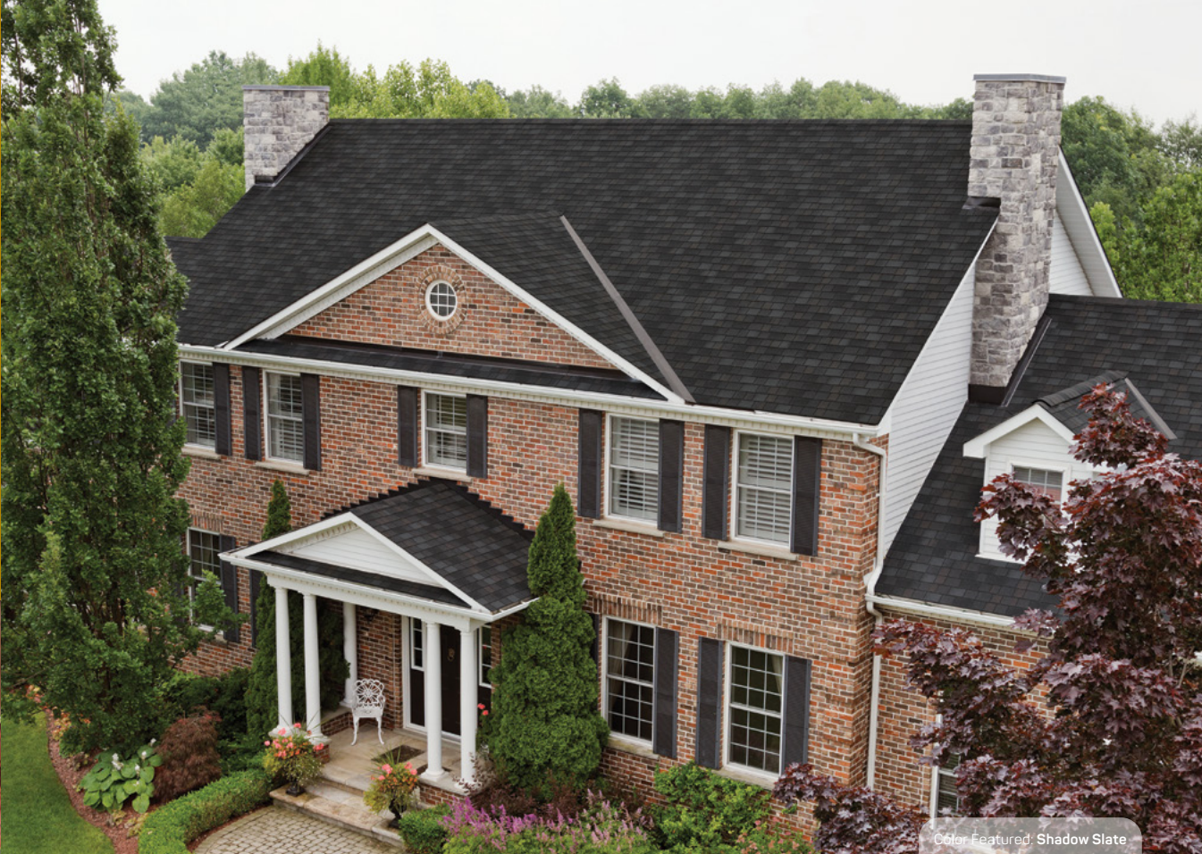
Color Featured: Shadow Slate