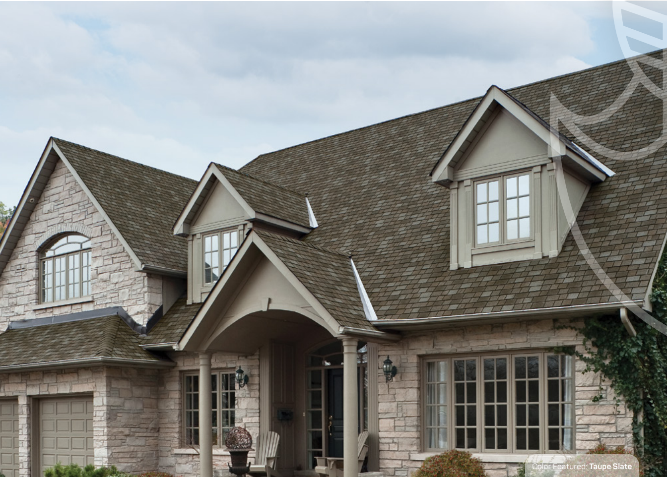
Color Featured: Taupe Slate