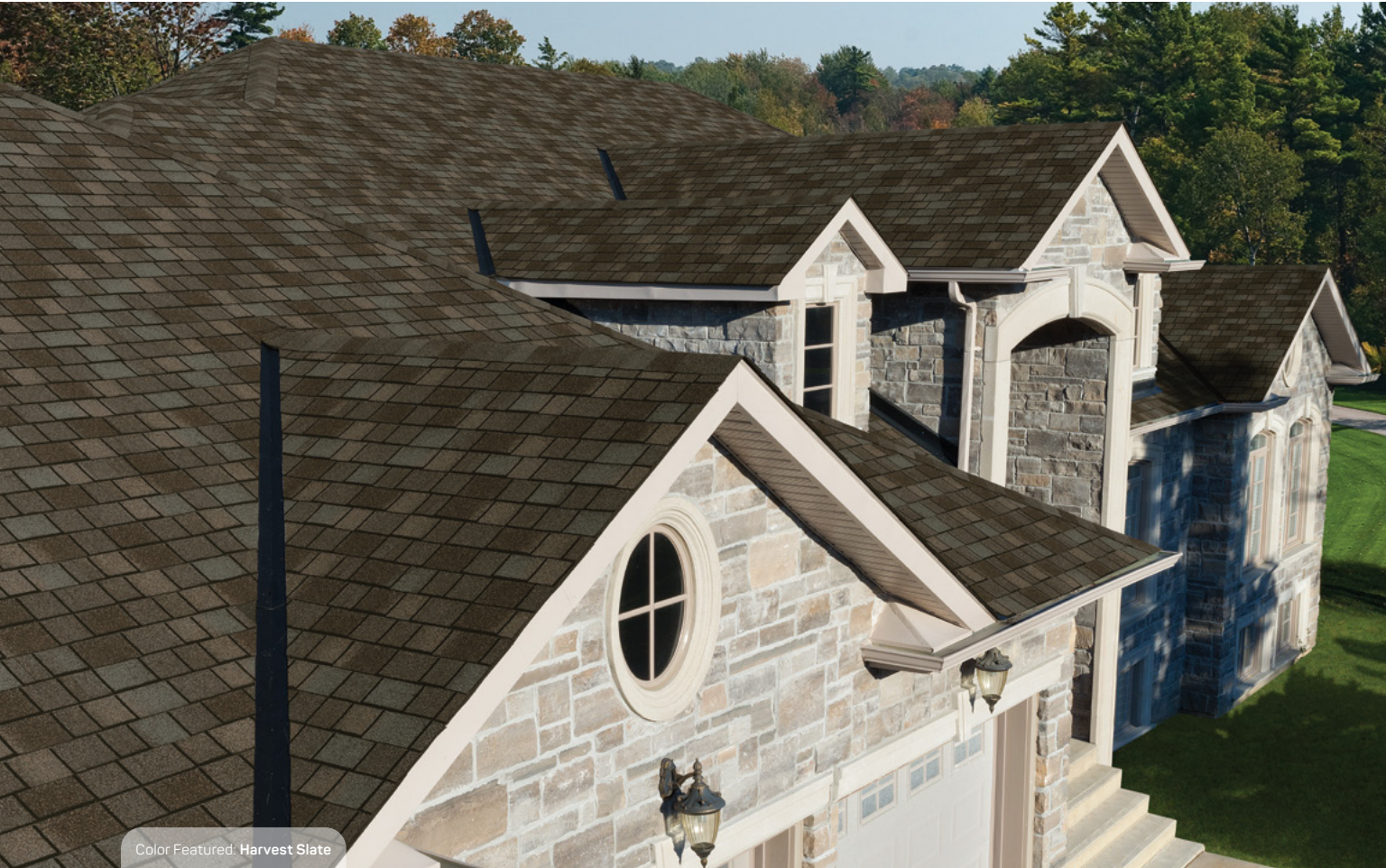
Color Featured: Harvest Slate