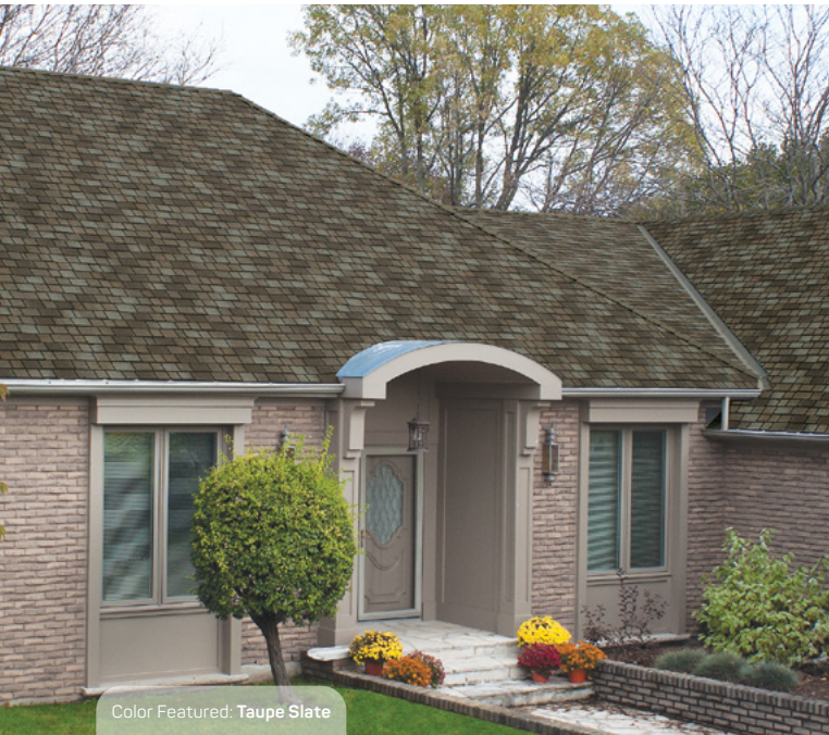
Color Featured: Taupe Slate

PERFECT PAIRINGS: Stone, masonry, wood, brick, siding (especially cream, beige or grey).